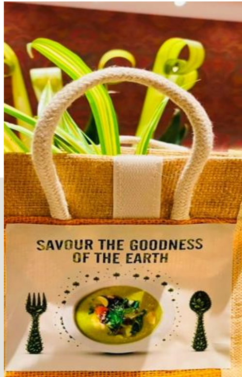
ITC Grand Chola