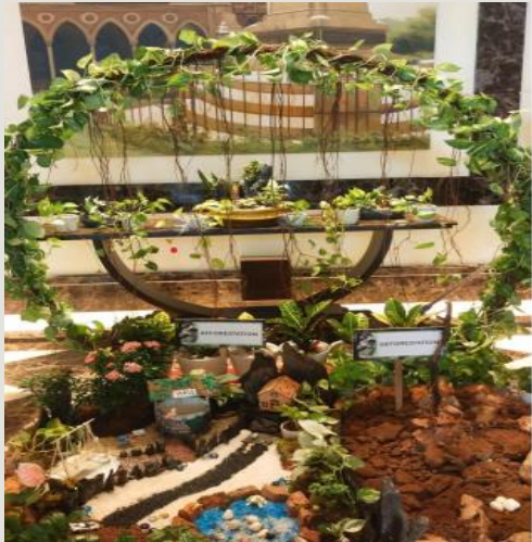
ITC Grand Central