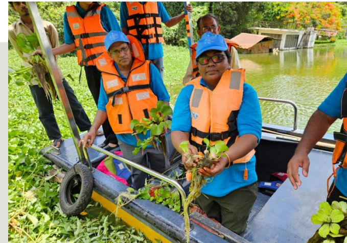
ITC Maratha, Lake Powai Cleaning

Mindful Restaurant Menus depicting sustainable consumption & Cleanliness Drives were organized by various units as part of their responsible Action towards Climate.